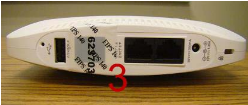
Figure 4 - RAP-108/109 TEL Placement - Side View